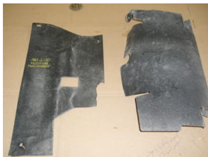
Left side is soft (Avalanche, Escalade & Denali)

Removing inner radiator flaps (look or feel for these on the left and right of your radiator) Determine which flaps you have, hard plastic or soft flexible fabric. Most Chevy trucks have hard plastic- requires the removal of the upper plastic support. You will replace this once the scoops are installed. This simply allows you easier access for removal.