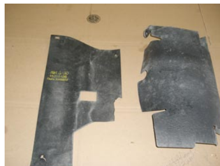
Right side hard plastic (Full size truck and Tahoe)